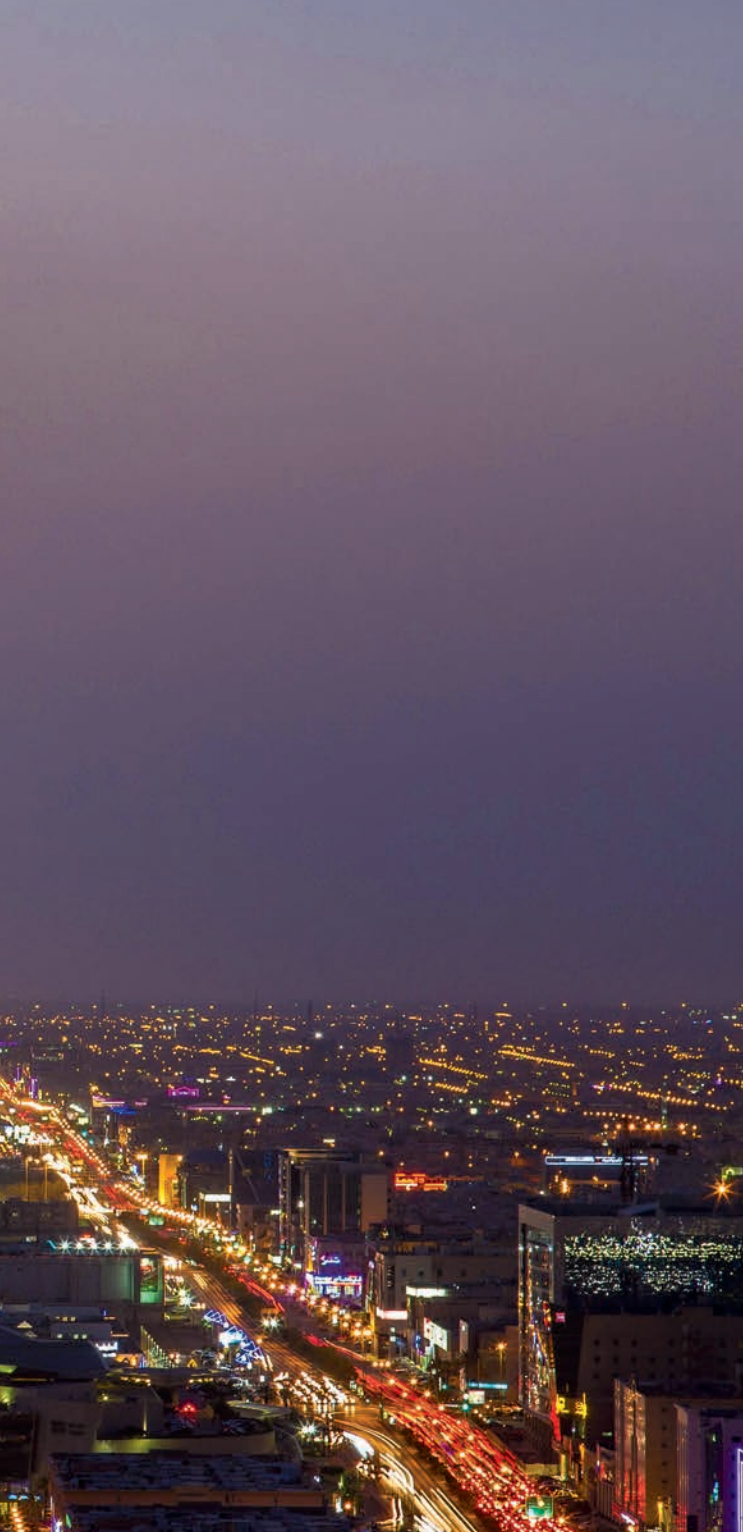
The skyline in Riyadh is a striking reminder of Saudi Arabia's rapid growth and urbanization. In 1960, the city had just 155,000 inhabitants; today it has more than 5 million.

meet about 20 percent of the kingdom's projected electricity needs—an aggressive target, given that solar today supplies virtually none of Saudi Arabia's energy and, as of 2012, less than 1 percent of the world's.