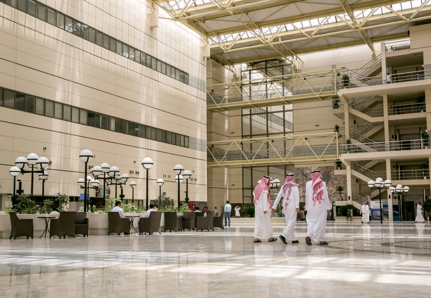
The King Abdulaziz City for Science and Technology, a national research-and-development agency based in Riyadh, is one of the key Saudi entities funding solar.

corral the competing constituencies to work together to modernize the country's energy system.